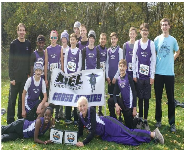
2019 Cross country team

48 won by the National League, 66 by the American League. Now this final inning will become the first inning of the 2019 Major League Baseball World Series.